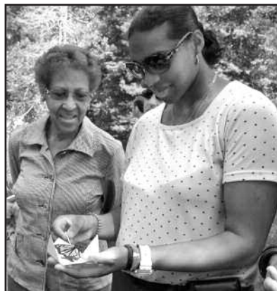
Families gathered outside Rye Nature Center to release Monarch butterflies in memory of their loved ones.