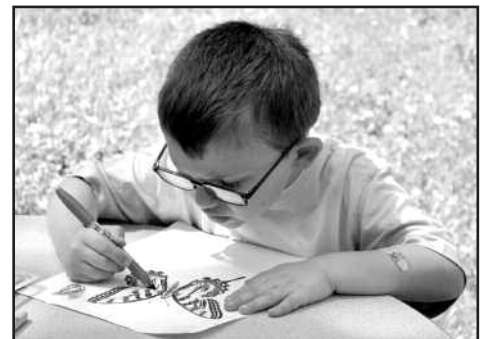
A child participates in craft activities at HPCW's Third Annual Memorial Butterfly Release.